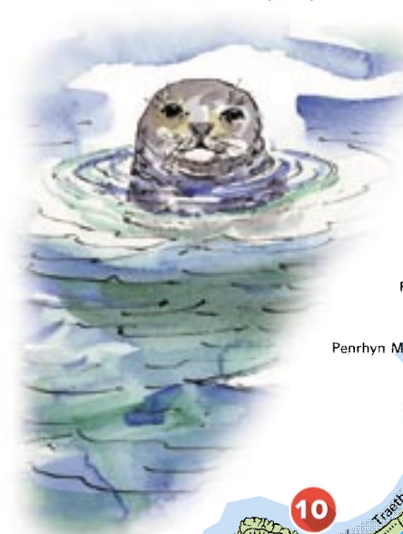
Morlo llwyd/Grey Seal

Mae'r llwybr wedyn yn ymdroelli'n hamddenol ar hyd yr arfordir. Dyma wlad y 'porthydd' gyda phob un ohonynt gyda'i nawn unigryw ei hun. Diolch i galedwch y graig, a bobwyd gan lafa chwilboeth, mae'r ardal hon wedi galluogi trigolion Llŷn i ddbynnu ar gyfuniad o gynnyrch môr a thir i'w cynnal. Fel cilfachau bach tywodlyd mae'r 'porthydd' megis Porth Ysgaden a Phorth Colmon yn ddelfrydol i lansio a glanio cychod ac er mai crancod a chimychiaid yw'r prif ysbail heddiw ar un amser dibynnai rhan helaeth y boblogaeth ar lanio penwaig.